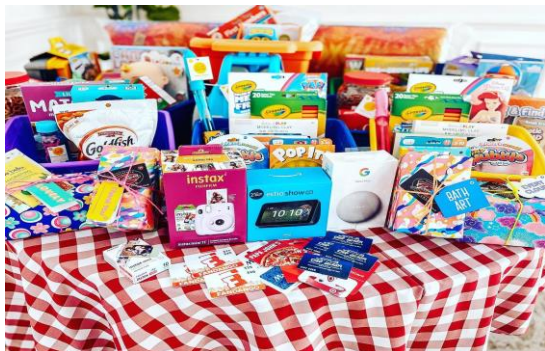
Back to School Bash