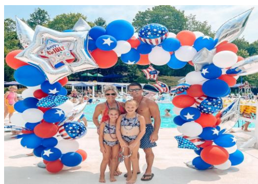
4th of July