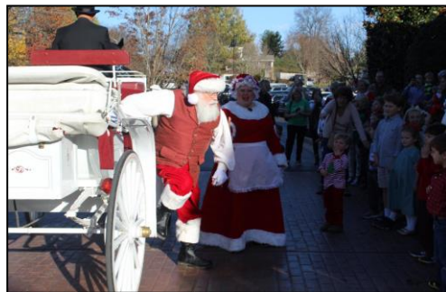
Cookies with Santa